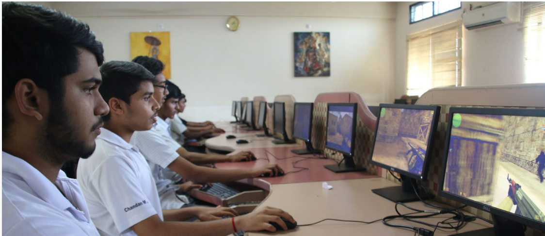
Department of Physics: