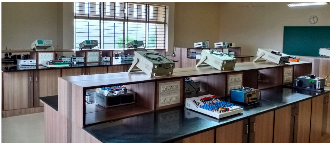
Department of Chemistry