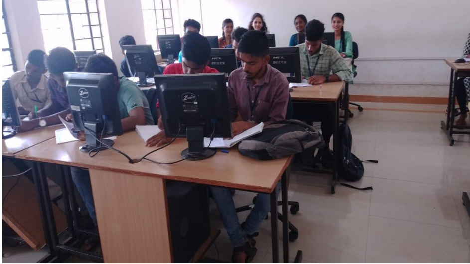
Department of Computer science